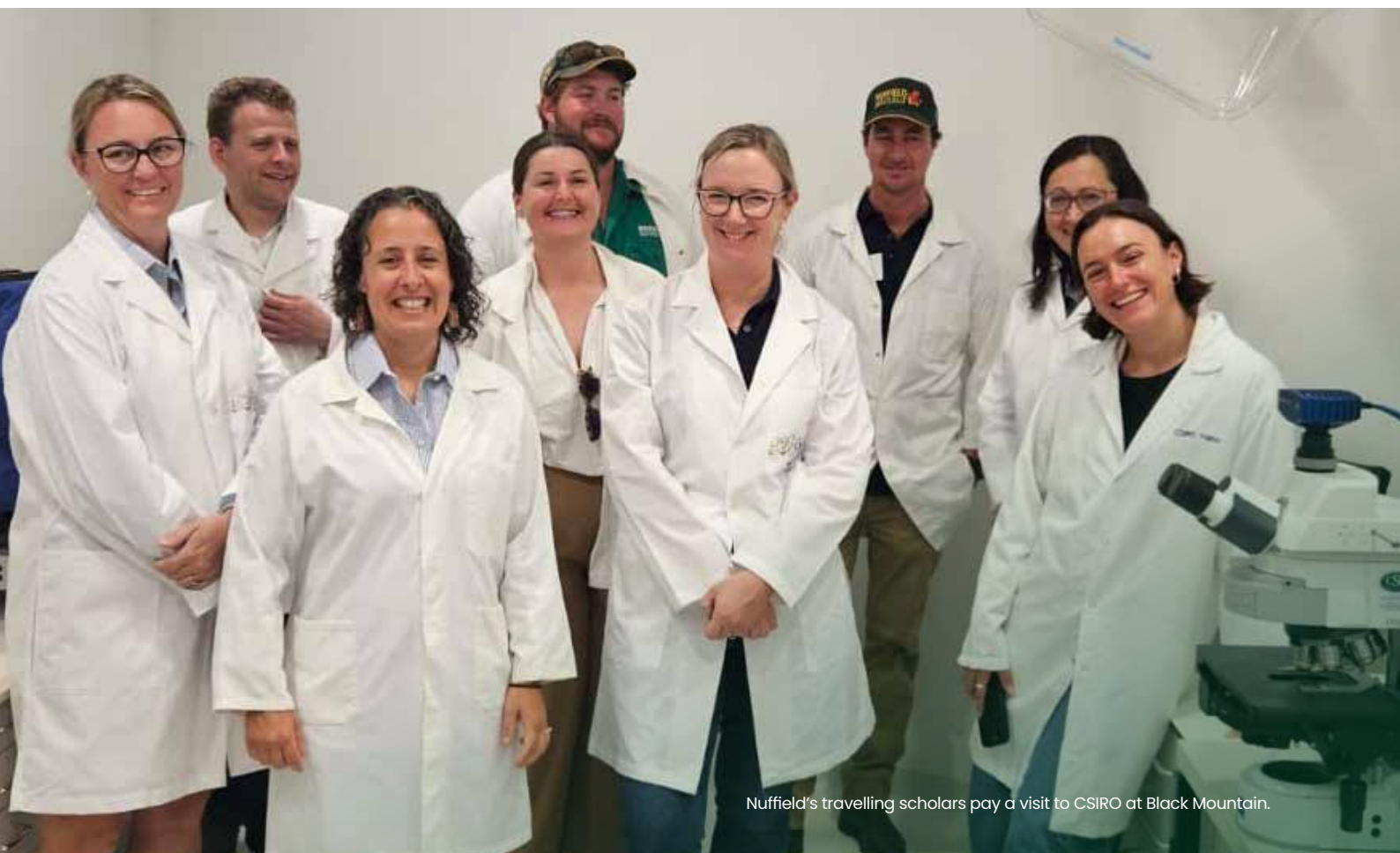
Nuffield's travelling scholars pay a visit to CSIRO at Black Mountain.

Since 2017, the initiative has facilitated the transfer of cutting-edge scientific research to practical farming applications, provided scientists with exposure to global agricultural practices and equipped both researchers and primary producers with insights, tools and an active network for addressing emerging challenges in the sector.